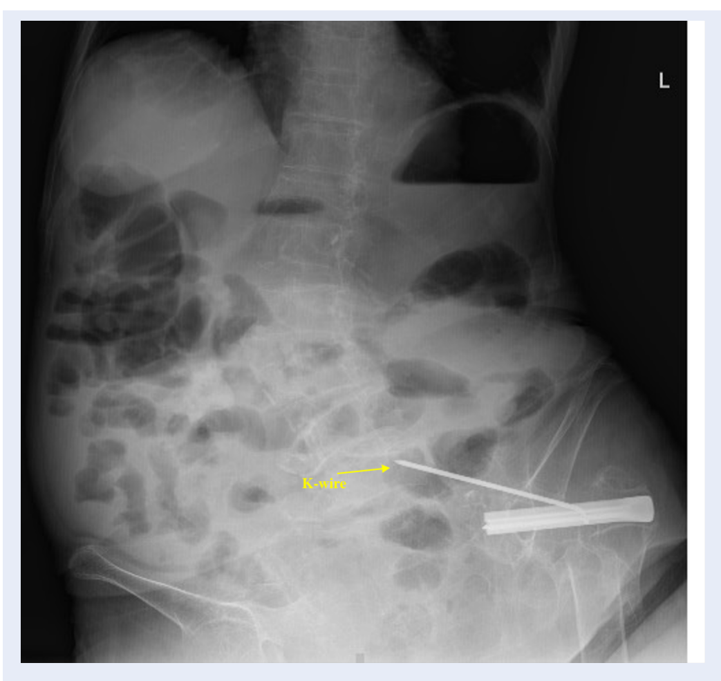
\textbf{Figure 1:} Abdominal\ radiography\ shows\ that\ the\ K-wire\ has\ shifted\ from\ its\ original\ position\ (yellow\ arrow).