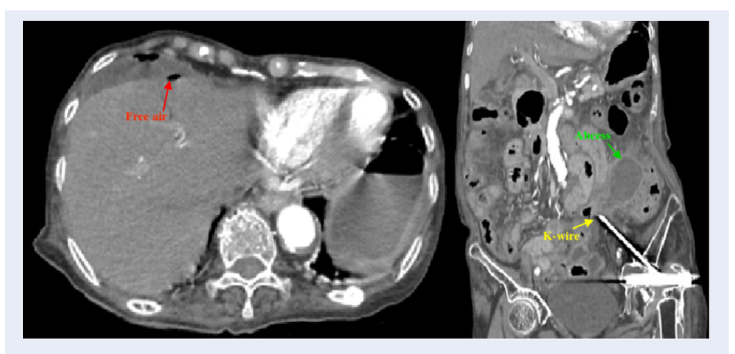
Figure 2: Abdominal computed tomography scan shows free air in the abdomen (red arrow), an abscess in the left iliac fossa (green arrow), and the K-wire penetrating into the pelvic adjacent to the abscess (yellow arrow).