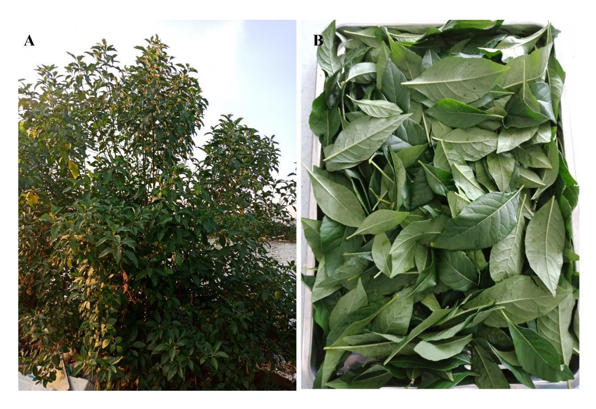
Figure S1: The bitter leaves were harvested from Xuyen Moc district, Ba Ria–Vung Tau province, Vietnam. (A) The leaves of the bitter leaf were harvested from Xuyen Moc, Ba Ria – Vung Tau and identified at VNU-HCM University of Science, Vietnam. (B) The leaves after being washed, drained and divided evenly into stainless steel trays for oven-drying.