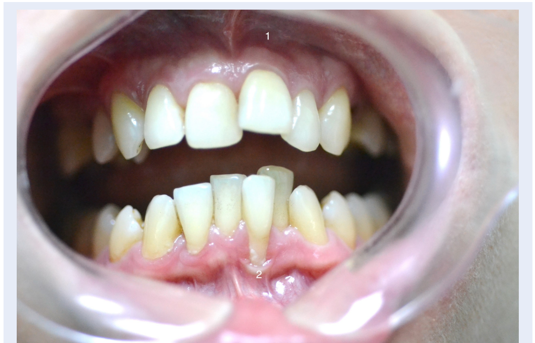
Figure 1: Picture of the dentition and areas of the oral mucosa. 1 – telangiectasia; 2 – McCall's feston.