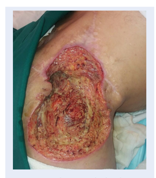
Figure 1: Fatty lesions in right gluteal tissue.

In February 2017, a 35-year-old man was referred to the Clinic of Hematology and Oncology, with painful scar history and swelling in the left pelvis ( Figure 1 ). After a physical examination of the patient, the physician asked for a CT scan and a biopsy from the pelvis. The pathology report showed a hypodense lesion with a diameter of more than 10 x 3 cm in the right gluteal