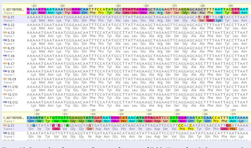
Figure 3C: Screen shot of sequence alignment of segment of Kelch 13 gene from isolates compared with Plasmodium 3D7 sequence ( cont'd ).

artemisinin resistance in different areas is advocated as regional differences in parasite response may exist in Nigeria<sup>38</sup>. A potential challenge will be to identify and validate resistance markers if unique markers exist in other areas. It is pertinent to monitor possible emergence in Africa from detected Kelch 13 SNP on codon A578S reported in some African countries ( e.g. Kenya)<sup>8,25</sup>, M579I in China (apparently imported from Guinea, Africa)<sup>26</sup>, and A675V in Uganda<sup>28</sup>, as well as other un-validated non-synonymous SNPs<sup>17</sup> in regions outside of Southeast Asia.