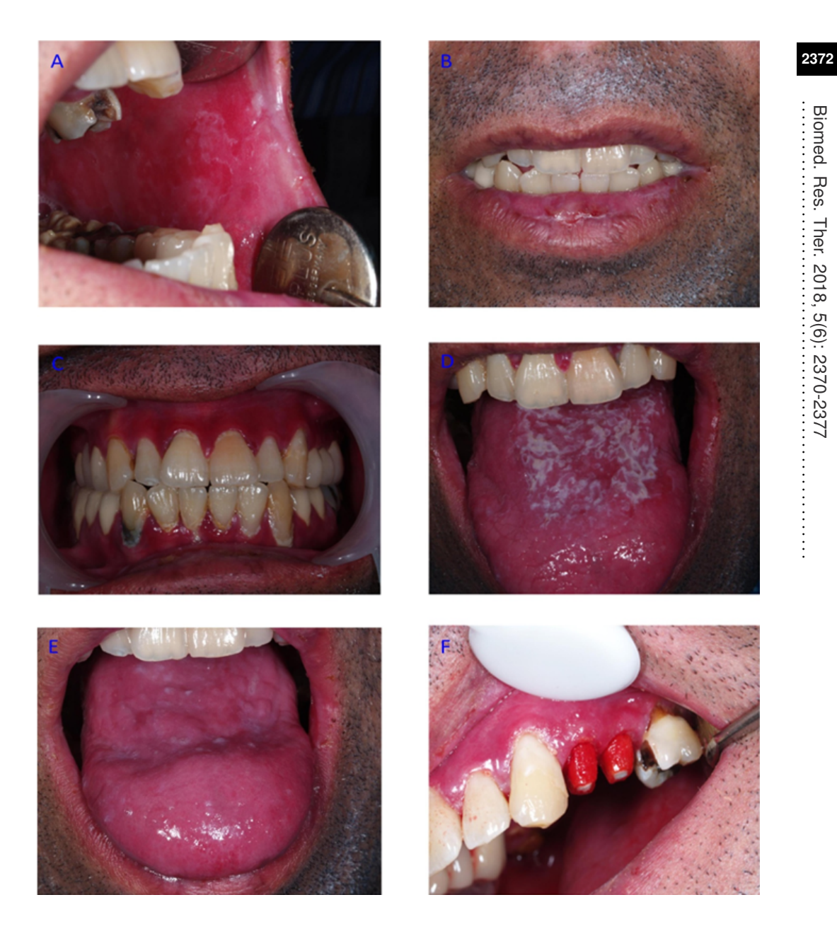
Figure 1. Photography: (A) Lichenoid lesion with erythema in buccal mucosa, (B) Lichenoid lesion of the vermilion area in the lower lip, (C) Desquamative gingivitis in upper and lower gums, (D) Lichenoid reaction on the ventral part of the tongue, (E) Partial recovery of the tongue after treatment, and (F) Post and the core of 1st and 2nd premolars.