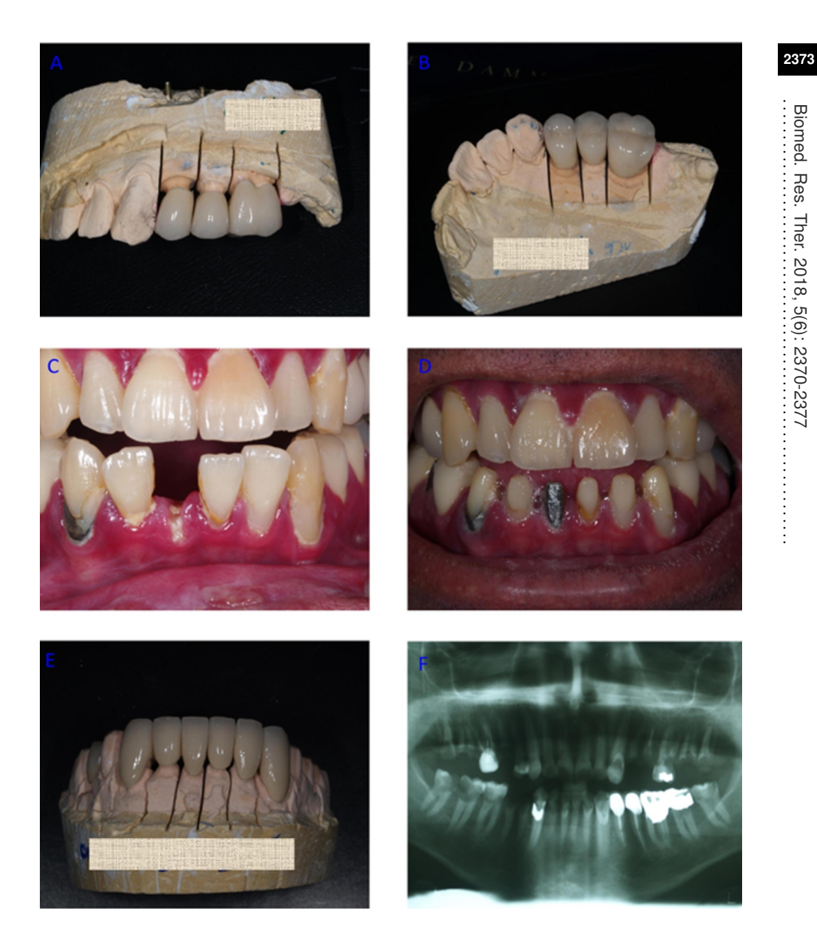
\textbf{Figure 2. Photography/Radiography: (A) } \ Crown \ of \ 1st \ and \ 2nd \ premolars, \ \textbf{(B)} \ Palatal \ area \ without \ the \ metal \ collar, \ \textbf{(C)} Broken tooth 25, (\mathbf{D}) Dental crowns, (\mathbf{E}) Dental crowns, and (\mathbf{F}) First panoramic radiography of the patient.